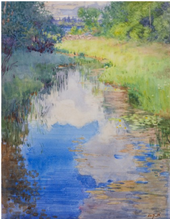
Walter J. Phillips STREAM AT KEEWATIN 1921 Watercolour