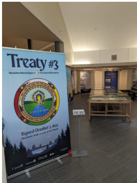
The Treaty # 3: Manidoo Mazina'igan – The Sacred Document Exhibit showed at the Museum from July 20 - November 10.