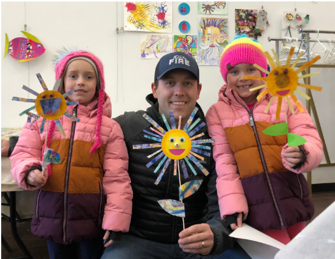
The Wiersma family pose with their splendid creations