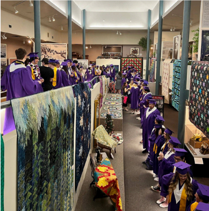
Excited grads from Beaver Brae Secondary School marshal for their graduation march at the Lake of the Woods Museum on June 29, 2023