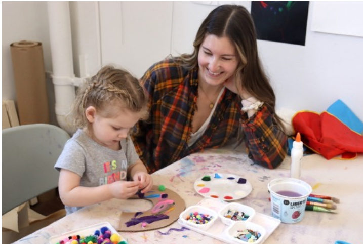
Family Crafternoons at the Douglas Family Art Centre are fun for the whole family!