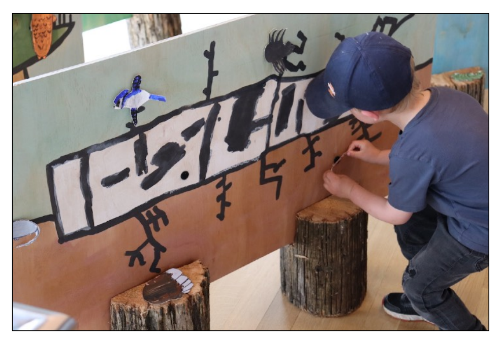
One young visitor engages with the "forest" that was created by students from Keewatin Public School for A Walk in the Wilderness exhibition of early years' art.

June 9 - Museum, Art Centre, and Memorial Park Attendance - 597